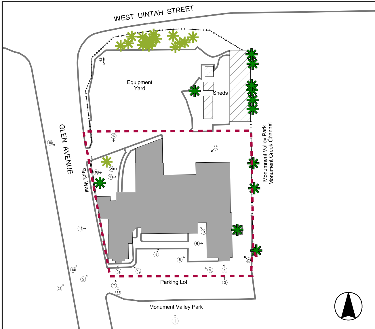
Sketch Map. The shaded building is the nominated Van Briggle Pottery Company, with the dashed line indicating the nomination boundary. Circled numbers with arrows are photograph locations and camera directions. Photographs 24, 25, and 26 are views of the interior of the south end of the west wing; photograph 27 is a view of the interior of the south end of the east wing. One inch equals approximately 52 feet.